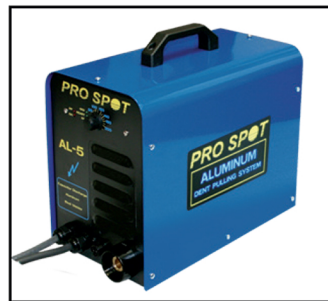
AL-5 Aluminum Stud Welder

The Aluminum Weld Station is designed to meet all of your aluminum repair needs. The station includes a portable welding cart, accessories for aluminum dent pulling, and the AL-5 Capacitor Discharge Stud Welder. The welding cart includes a tool board, utility panel (air outlets, 110V or 220V electrical outlets), a work surface covered with a high quality textured rubber mat, heavy duty adjustable shelves, and a sliding drawer for storage. The AL-5 is designed for aluminum dent pulling and welding UHSS panels.