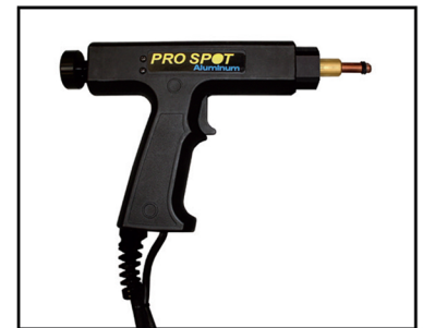
Stud gun with trigger