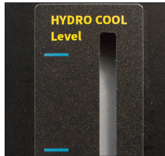
Water Coolant Level Indicator