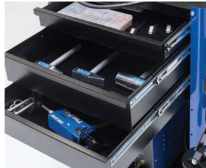
Dedicated drawers for steel and aluminum tool storage