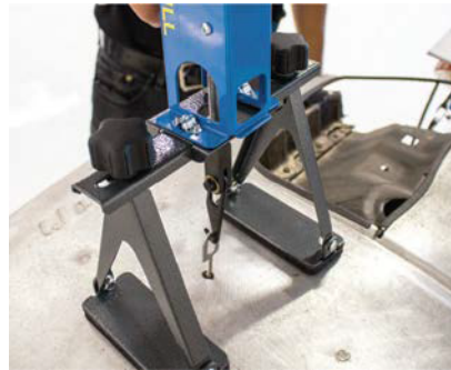
The PRO-65 provides targeted dent pulling