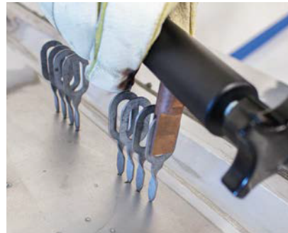
Save time with quick application of pull keys