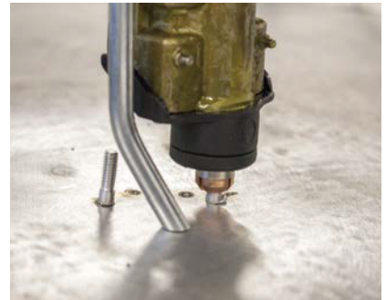
Apply keys and studs with Drawn Arc Welding