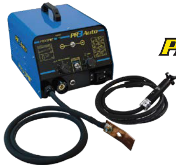
PR3 Auto PR-3 Auto (230V) or (400V)

Using the PR-3 Auto for fast, efficient steel dent repair and the PS-DA5's drawn arc technology for precise aluminum dent repair – you have a one-stop dent repair solution for your shop.