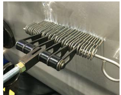
Tightly arrange keys for a more consistent pull