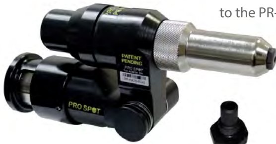
Assorted Rivet Ferrules

The Blind Rivet Adapter seamlessly connects to the PR-5D Rivet Gun. Pivots to any desired position.